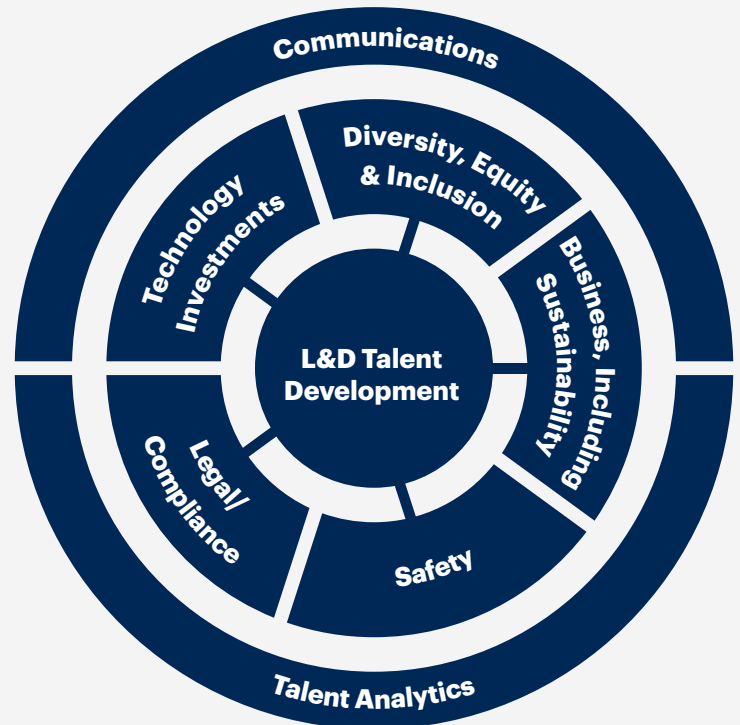
Figure 1. L&D's Cross-functional Partnerships in ESG Reporting

L&D leaders will partner with occupational safety and total rewards colleagues to develop the narrative for the health and safety section of the ESG report. Mandatory safety training and new training developed as a result of employee injury or work-related illness should be described. This section of the report will include well-being training activities designed to support employees' physical and emotional health and wellness. Companies will use this section to explain how they are keeping employees safe in light of COVID-19 and other emerging public health concerns. A link to the organization's human rights policies should also be included.